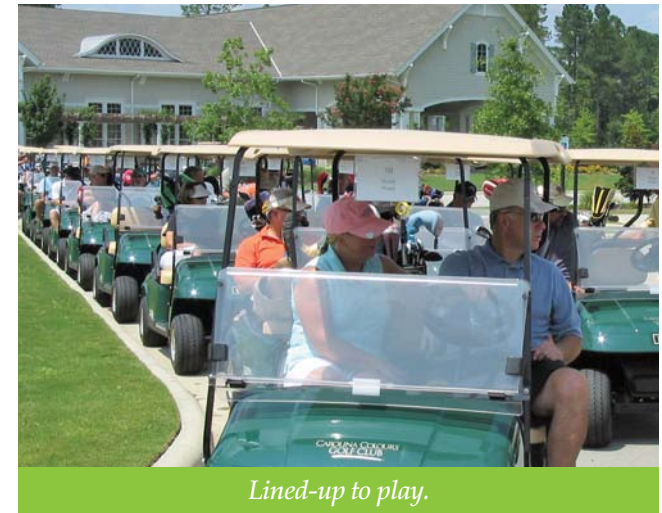
Lined-up to play.